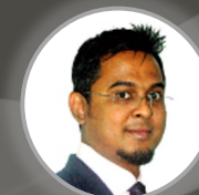
Shaufique Fahmi Ahmad Sidique SPE, IKDPM Journal of Cleaner Production