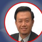
Taufiq Yap Yun Hin FS Journal of Cleaner Production